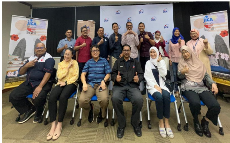
Mesyuarat Agong Tahunan myJICA ke-36 ADAMSON HOTEL, 79. LRG HAJI HUSSEIN 2, CHOW KIT, 50300 KUALA LUMPUR