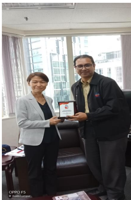
Mesyuarat Agong Tahunan myJICA ke-36 ADAMSON HOTEL, 79. LRG HAJI HUSSEIN 2, CHOW KIT, 50300 KUALA LUMPUR