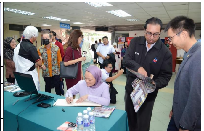
Mesyuarat Agong Tahunan myJICA ke-36 ADAMSON HOTEL, 79, LRG HAJI HUSSEIN 2, CHOW KIT, 50300 KUALA LUMPUR