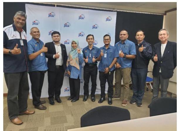
Mesyuarat Agong Tahunan myJICA ke-36 ADAMSON HOTEL, 79. LRG HAJI HUSSEIN 2, CHOW KIT, 50300 KUALA LUMPUR