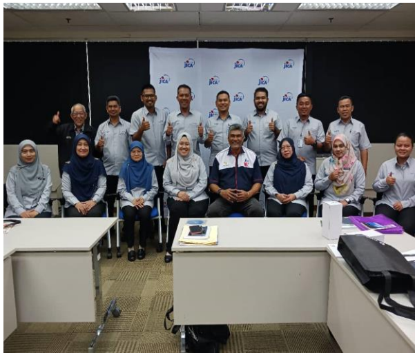
Mesyuarat Agong Tahunan myJICA ke-36 ADAMSON HOTEL, 79. LRG HAJI HUSSEIN 2, CHOW KIT, 50300 KUALA LUMPUR