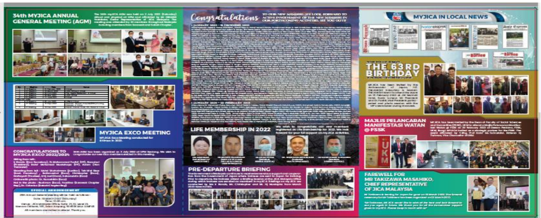
Previous myJICA Bulletin