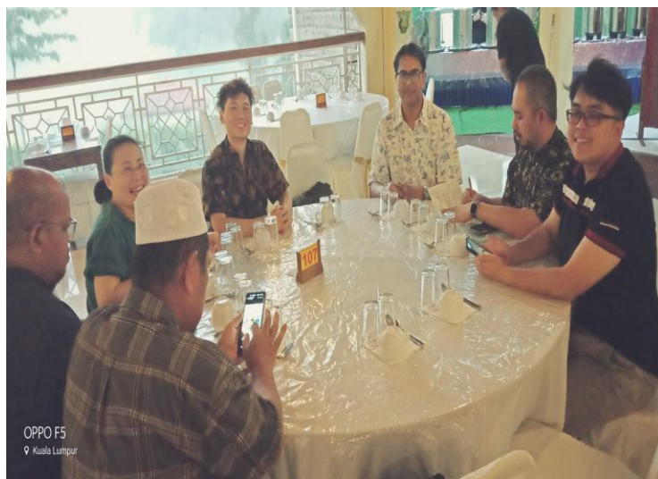
Mesyuarat Agong Tahunan myJICA ke-36 ADAMSON HOTEL, 79, LRG HAJI HUSSEIN 2, CHOW KIT, 50300 KUALA LUMPUR